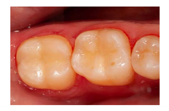
Simple occlusal decay on Teeth #30-31 , shade A2/A3 . OMNICHROMA Flow BULK was used.