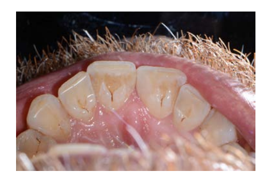
Patient presented with Class III, shade A2 . Restored with OMNICHROMA .