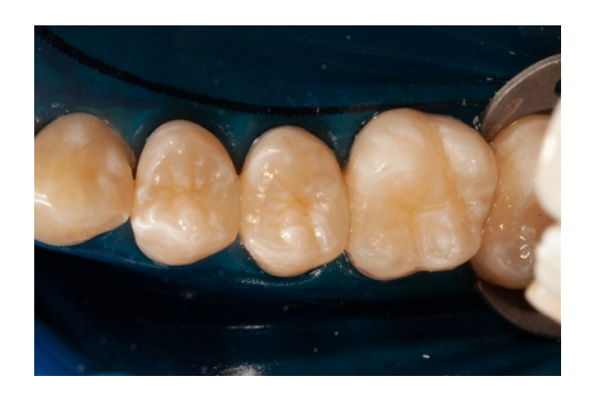
Small interproximal caries on Teeth #12-14 . OMNICHROMA Flow was used.