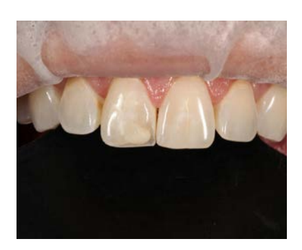
OMNICHROMA BLOCKER was layered sufficient to block out the hard incisal edge