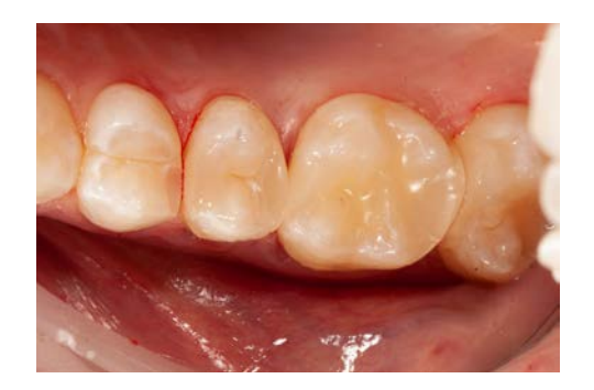
Interproximal decay removed on Teeth #2-4, shade A2 . OMNICHROMA Flow BULK was used.