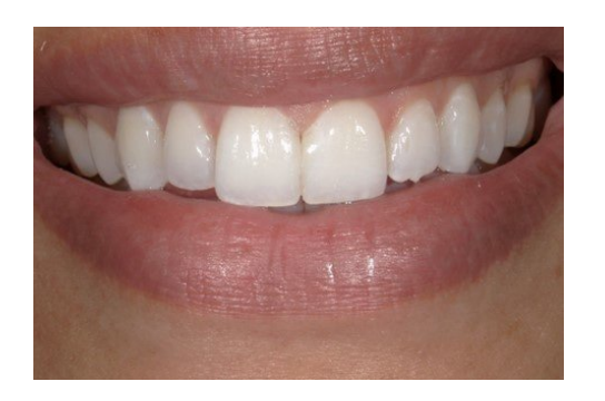
Patient presented with a black triangle between Teeth #8-9 . Using OMNICHROMA Flow , we added to the mesial of both teeth to close the diastema.