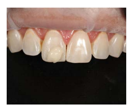
Final layer of OMNICHROMA was placed and cured